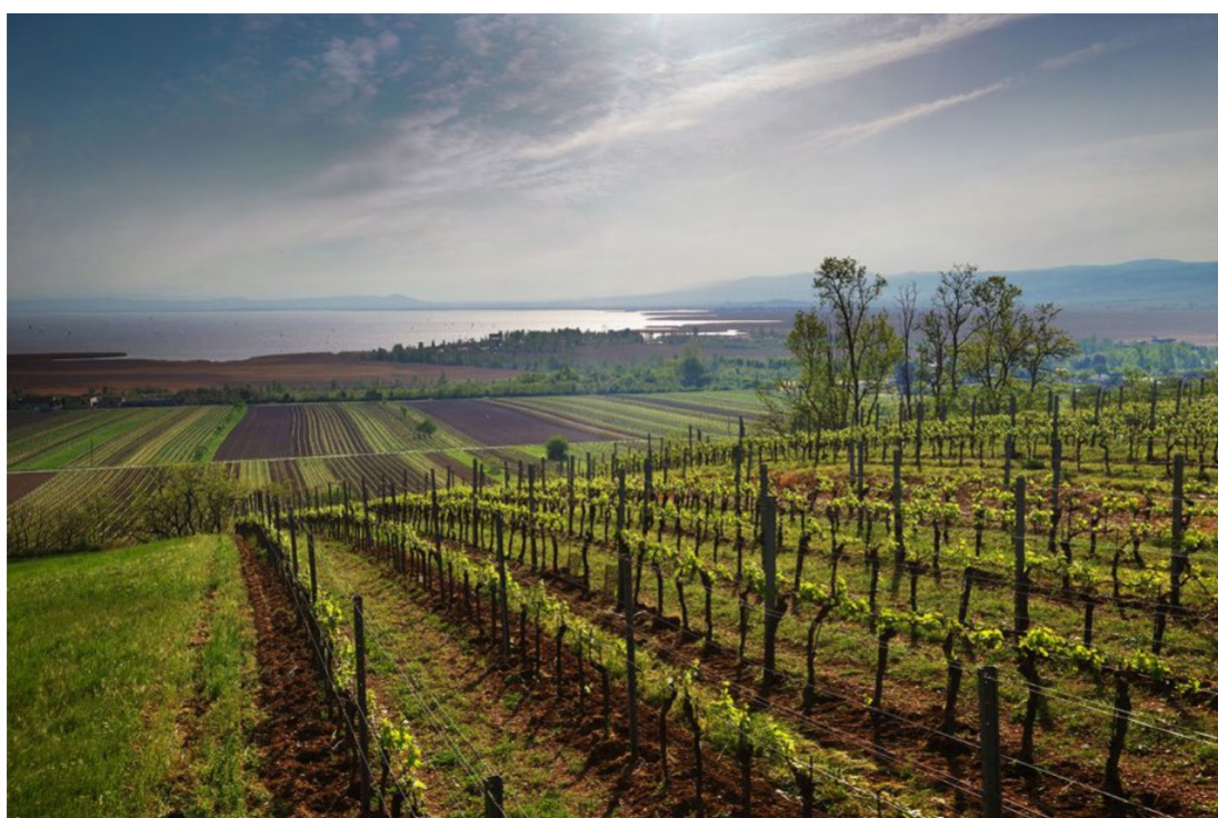
Ried Ungerberg, Neusiedlersee-Wagram lake view by Marcus Wiesner. Credit: Wine Austria