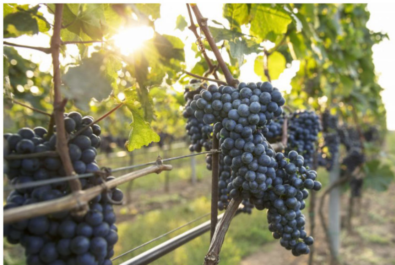
Zweigelt grape by Bernd Weiss.

A 'Reserve' category was also set up to merit those with over 18 months of ageing in oak (large or small).